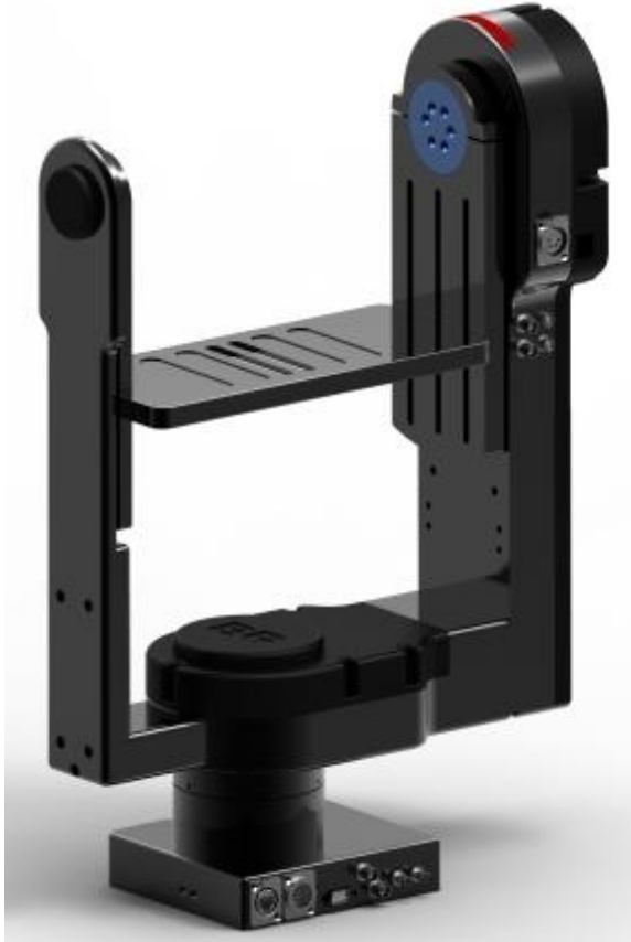
Height & Width Extended with Side Support