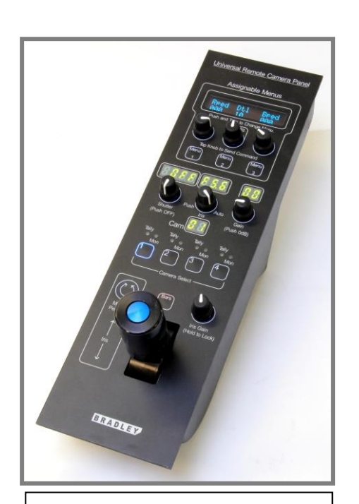
Remote Camera Panel

Please refer to our website for details of other products that we offer – <a href="http://br-remote.com/products">http://br-remote.com/products</a>