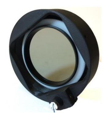
Variable ND Filter

There is also CamBall Net-Cam version. (toughened housing and faster operation for in-goal applications)