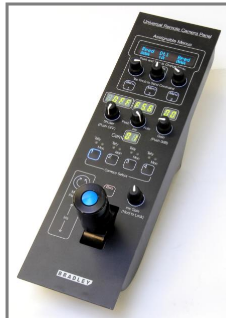
Remote Camera Panel

Please refer to our website for details of other products that we offer – http://br-remote.com/products