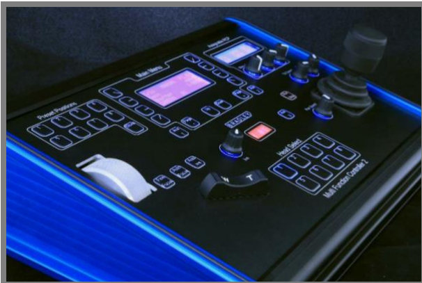
Multi Function Controller

Joystick Controllers Remote Camera Panels Radio data links Fibre Converters IP Converters